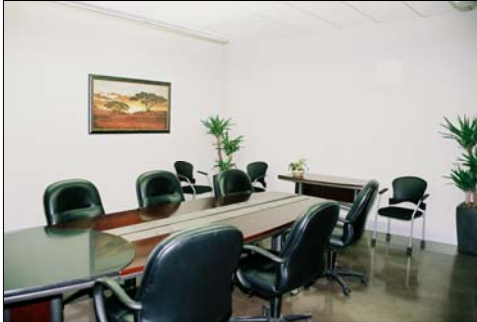
Large Conference Room, 15x24, common area