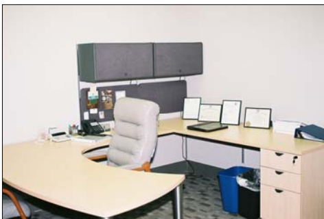
Private Office Space, 18x13.6