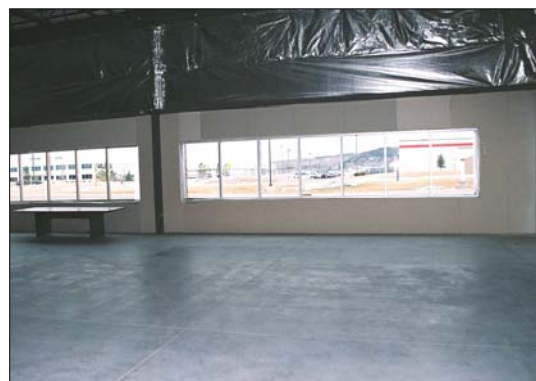
Great Window Space for Showroom or Office