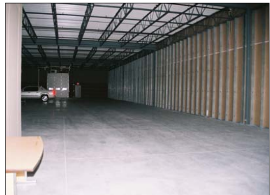
Bays 160 feet deep