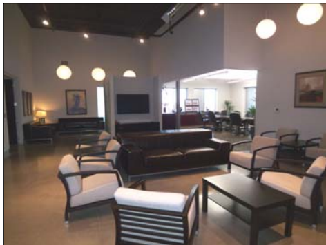
Spacious Great Room, 24x36, common area