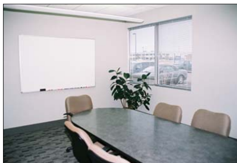
Two Conference Rooms, 6x13, common area