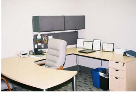
Executive Office Suites